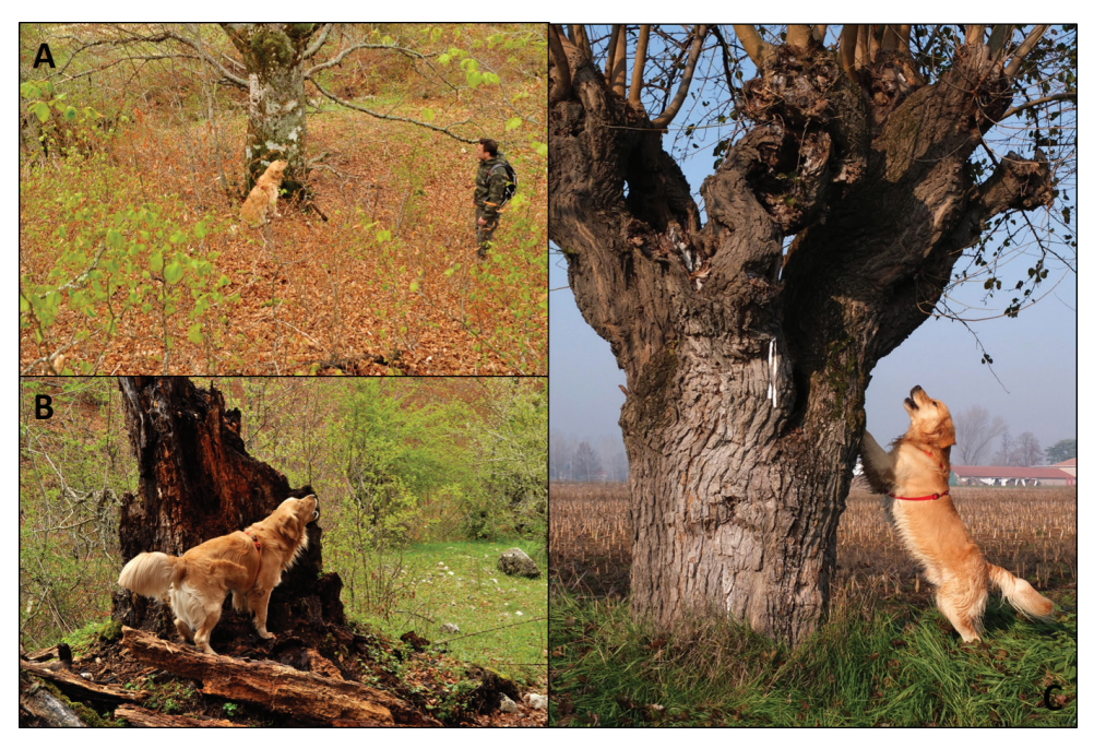
Figure 5. Teseo signalling the target to the handler: A sitting beside a tree containing the target, barking and looking at scent source and handler B pointing the target, barking and looking at the handler C scratching the trunk and barking (Photos A and B by Emilia Capogna, photo C by Sönke Hardersen).

sometimes showed some faint reactions to the larvae of the other species (e.g. sitting beside the source of the odour or barking weakly). After 2 or 3 repetitions of the tests, Teseo showed no reactions to the larvae of O. nasicornis and G. variabilis . However, it was noticed that during a few of the training sessions following these discrimination tests, the dog committed a higher rate of errors. Nevertheless, after a few training sessions, Teseo recovered his usual level of accuracy. For this reason it was decided to stop these tests.