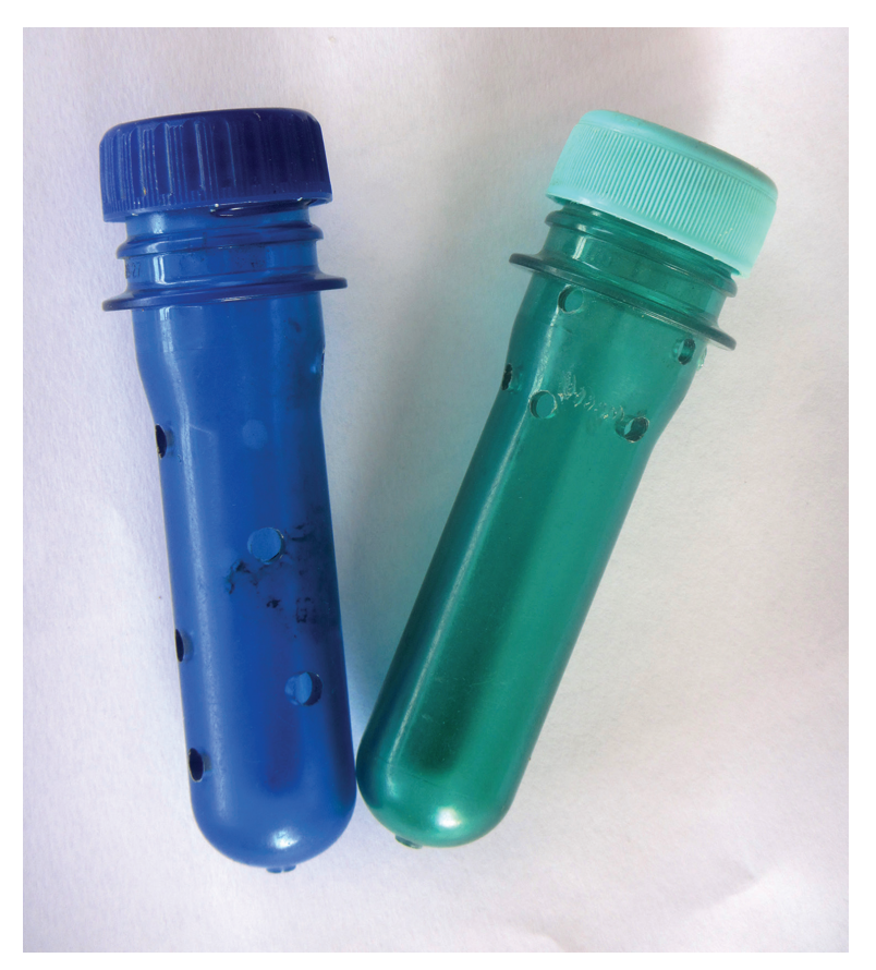
Figure 2. Perforated vials in which the larvae were inserted to protect them during training.

wood mould). During each training session, the dog searched one tree a time and was rewarded only when it signalled the correct tree.