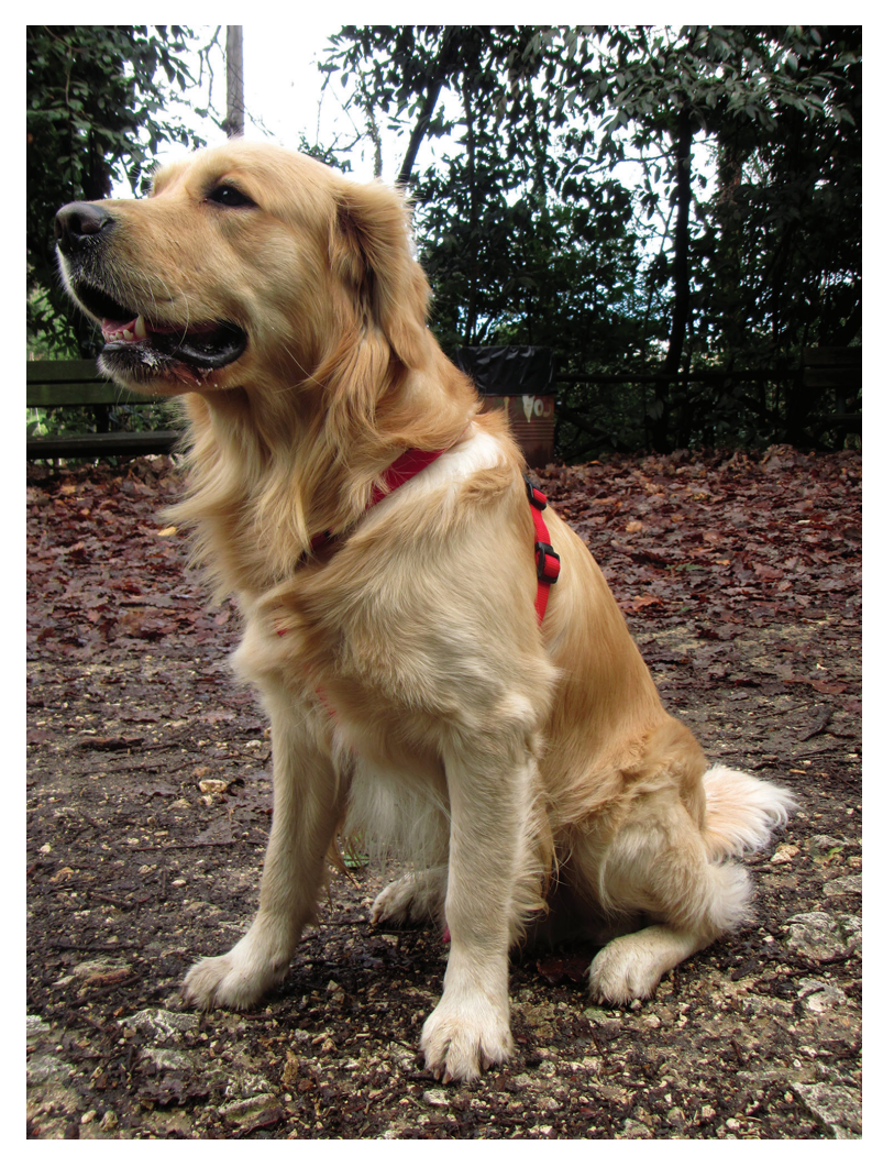
Figure 1. Teseo wearing the harness (Photo by Fabio Mosconi).

The training was carried out in successive steps, as a function of the age of the dog and according to the level of skill (Table 1). A collection permit was issued by the Ministero dell'Ambiente e della Tutela del Territorio e del Mare - DG Protezione della Natura e del Mare (U.prot PNM 2012-0010890 del 28/05/2012) to handle larvae of O. eremita for dog training.