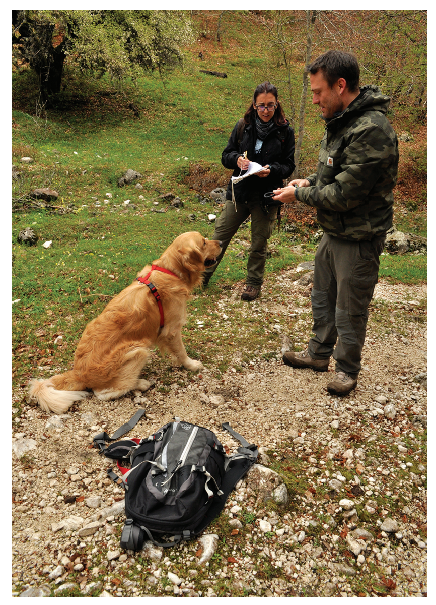
Figure 4. The CDD team: the dog, the handler and the field assistant ready for a working session.

down, barking and looking at the scent source and the handler (Figure 5). Sometimes, Teseo scratched the bark if the source of the odour was located in the upper part of a tree. In a single field session, the dog was able to work for about 50 minutes, after which it needed to rest for 15 to 60 minutes before resuming work. Fatigue and high ambient temperatures caused a general decrease in the dog's working ability.