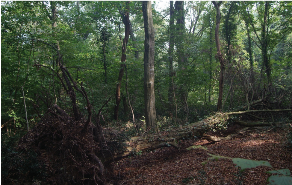
Figure 4. Bosco della Fontana: large amount of dead wood due to special conservation management since 1992.

and industrial buildings. The forest is dominated by pedunculate oak ( Quercus robur ) and hornbeam ( Carpinus betulus ), with a dense understory of hazel ( Corylus avellana ), hawthorn ( Crataegus laevigata ) and European spindle ( Euonymus europaeus ). In the northern part of the forest, the pedunculate oak is replaced by Turkey oak ( Quercus cerris ), while in the eastern part, southern ash ( Fraxinus angustifolia ) and black alder ( Alnus glutinosa ) are abundant. Between 1952 and 1958, allochthonous tree species ( Quercus rubra , Platanus x acerifolia , Juglans nigra ) were planted and the Life Project NAT/IT99/6245 initiated the elimination of the most invasive species, Q. rubra (Cavalli and Mason 2003, Mason 2003, Mason and Minari 2009). From the early 1990s, no wood has been removed from the forest and therefore the amount of dead wood increased: in 1995 it consisted of ca 26 m 3 /ha on average (Mason 2002a) but locally reached 124 m 3 /ha (Travaglini et al. 2007). Further information on management of the reserve are in Cavalli and Mason (2003), Mason et al. (2004), Campanaro et al. (2014). At Bosco della Fontana monitoring methods were tested for L. cervus , C. cerdo and M. asper .