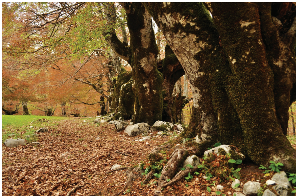
Figure 8. Parco Nazionale d'Abruzzo, Lazio e Molise: old growth beech forests where monitoring methods were tested for both Osmoderma eremita and Rosalia alpina.

Forests of the Park are home to at least four species of saproxylic beetles investigated by the project: L. cervus , O. eremita , R. alpina and M. asper asper . Monitoring methods were tested only for the first three species in the transitional belt between beech forest and mixed deciduous broadleaf forest, at an altitude of 700 to 900 m a.s.l., in several sites around the Lama Forest refuge (43.4312°N, 11.8381°E), i.e. Poggio Ghiaccione, Poggio Piano, La Vetreria, and the road to Badia. Only O. eremita was also monitored in the old chestnut orchard near to Camaldoli (43.7874°N, 11.8208°E) at an altitude of 820–870 m a.s.l.