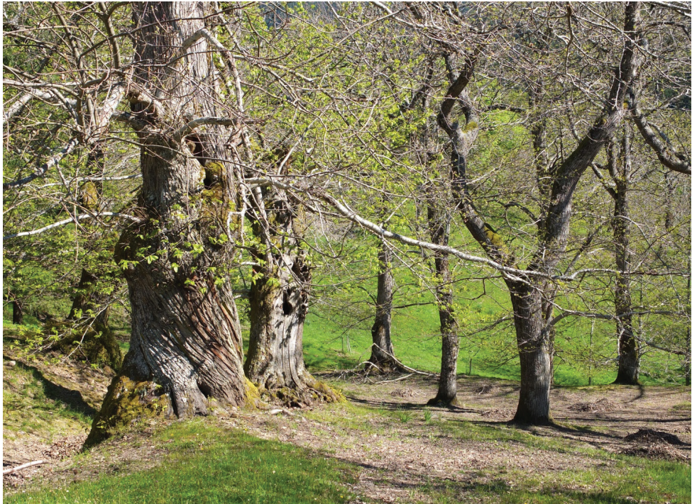
Figure 6. Foreste Casentinesi: old chestnut orchards where a population of Osmoderma eremita was discovered for the first time by the MIPP researchers.