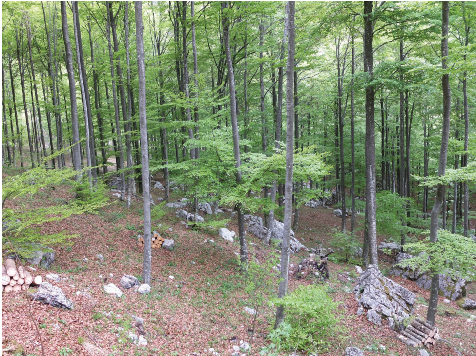
Figure 3. Parco Naturale Regionale delle Prealpi Giulie: young and even-aged beech trees, poor in dead wood. Wood piles were built for attracting Morimus asper funereus.

This area (750–850 m a.s.l.) is managed by shelterwood cutting and dead wood is removed. It resulted in young and even-aged beech trees and was poor in dead wood. However, owing to the local very steep morphology, dead wood occurs in small and isolated pockets of forests, favoured by limited accessibility or avalanches. Although the Park hosts populations of Lucanus cervus , Rosalia alpina and Morimus asper funereus , monitoring methods were only tested for the latter.