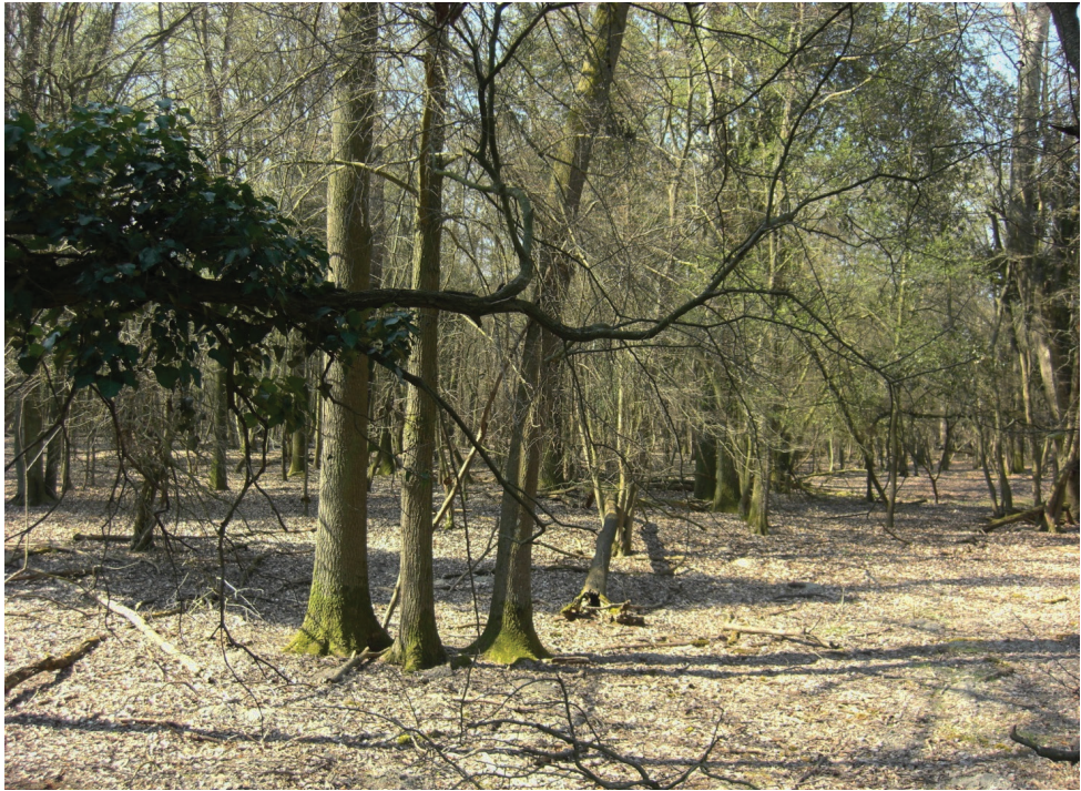
Figure 5. Bosco della Mesola: coastal lowland forest, where the abandonment of traditional management of the forest since the 1970s has resulted in an increase in dead wood (Photo by Gloria Antonini).

(IT 4060006) and of the Regional Park of the Po Delta, is located in the Province of Ferrara about 16 km from the Adriatic coast. This forest is a coastal lowland woodland of high importance for conservation, dominated by holm oak ( Quercus ilex ) and pedunculate oak ( Quercus robur ). Other important tree species occurring in the area are hornbeams ( Carpinus betulus and C. orientalis ), ashes ( Fraxinus angustifolia and F. ornus ), poplars ( Populus alba , P. tremula , P. nigra ) and field elm ( Ulmus minor ). The understory is scarce and the most abundant species are common hawthorn ( Crataegus monogyna ) and wild privet ( Ligustrum vulgare ). Between 1945 and 1971, non-native trees were planted, such as stone pine ( Pinus pinea ) and maritime pine ( Pinus pinaster ). The abandonment of traditional management of the forest since the 1970s has resulted in an increase in dead wood which is now very abundant. The research conducted during the MIPP project in the Bosco della Mesola (44.8485°N, 12.2511°E) was focused on testing the monitoring methods for C. cerdo and M. asper asper .