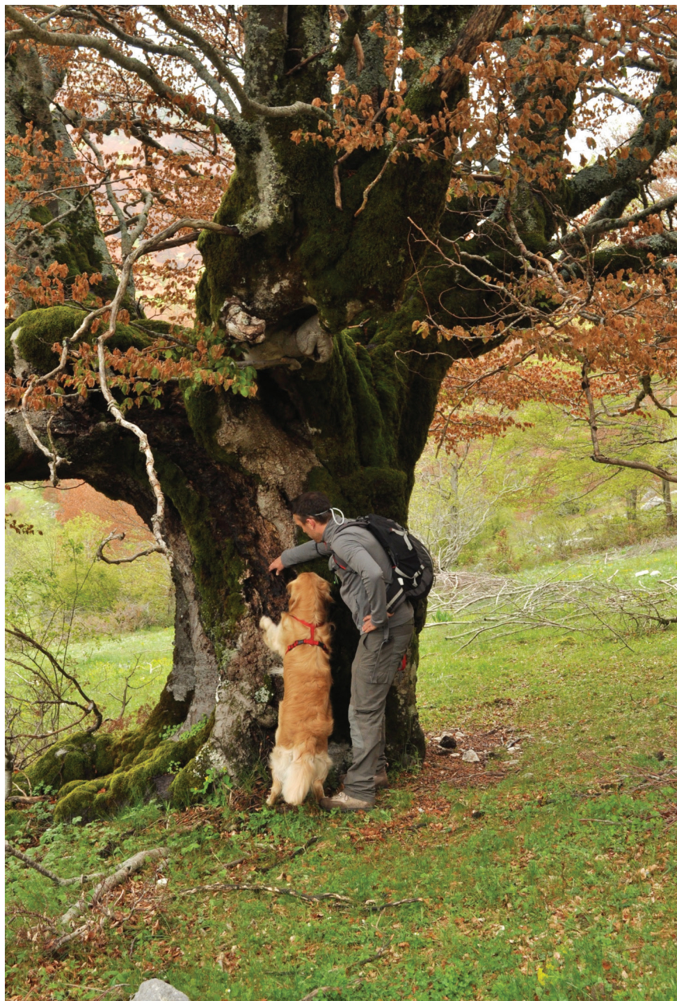
Figure 9. The trained dog searching for hermit beetles with his handler (Fabio Mosconi) in the old growth forest of Difesa di Pescasseroli.