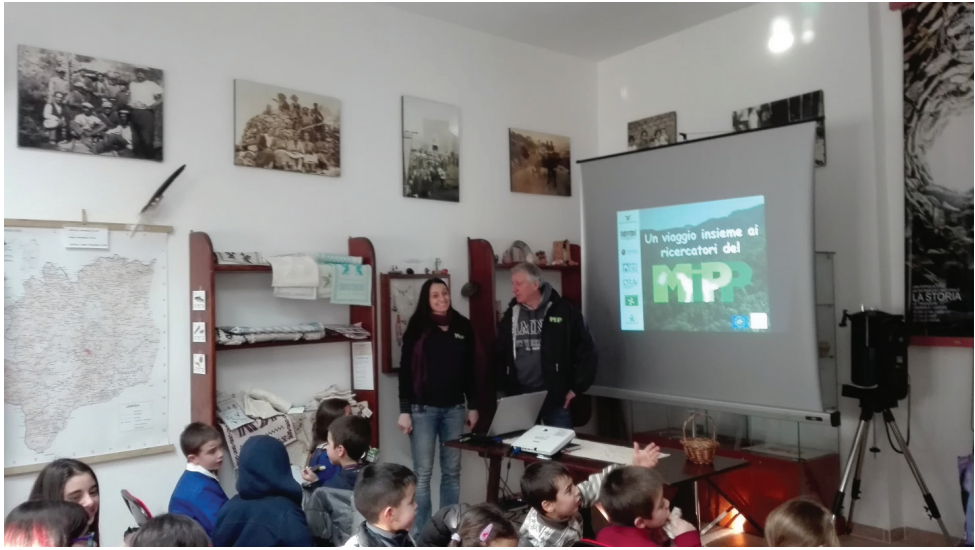
Figure 11. Dissemination activities in primary school: a field trip together with MIPP researchers.

areas, developing monitoring methods for cryptic and elusive species, organising a citizen science project to increase the knowledge on the distribution of rare and protected insects, educating people on biodiversity and Natura 2000 and on the importance of veteran trees in forest ecosystems, etc. Due to the goodwill and hard work of many people, obstacles and hurdles were overcome and the project managed to complete all planned actions successfully. The articles in this special issue provide the scientific results on testing monitoring methods and the detailed presentation of the method which resulted in being the most appropriate in terms of costs and accuracy for monitoring the conservation status of the five saproxylic beetles targeted by the project. Two of these articles have been dedicated respectively to the successful results of two subprojects: the citizen science and the training of a dog for detecting O. eremita in the field.