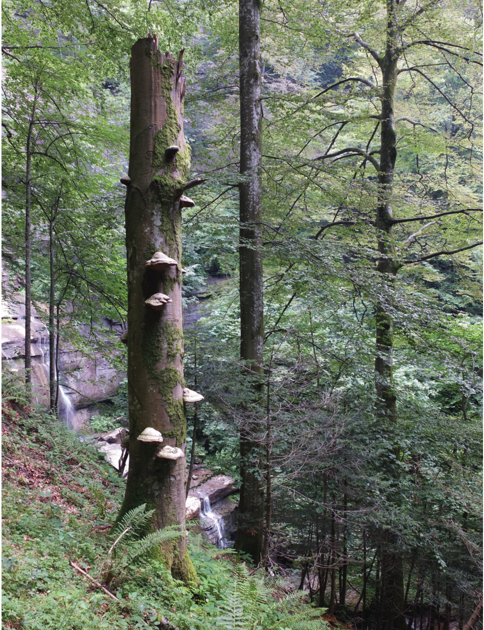
Figure 7. Foreste Casentinesi: natural beech forest where three target species were monitored, Lucanus cervus , Osmoderma eremita and Rosalia alpina.

mon laburnum ( Laburnum anagyroides ), wild cherry ( Prunus avium ) etc. Finally, near to human settlements, e.g. near the Monastery of Camaldoli, there are some very old stands of Castanea sativa which are managed as coppice or chestnut orchards. The