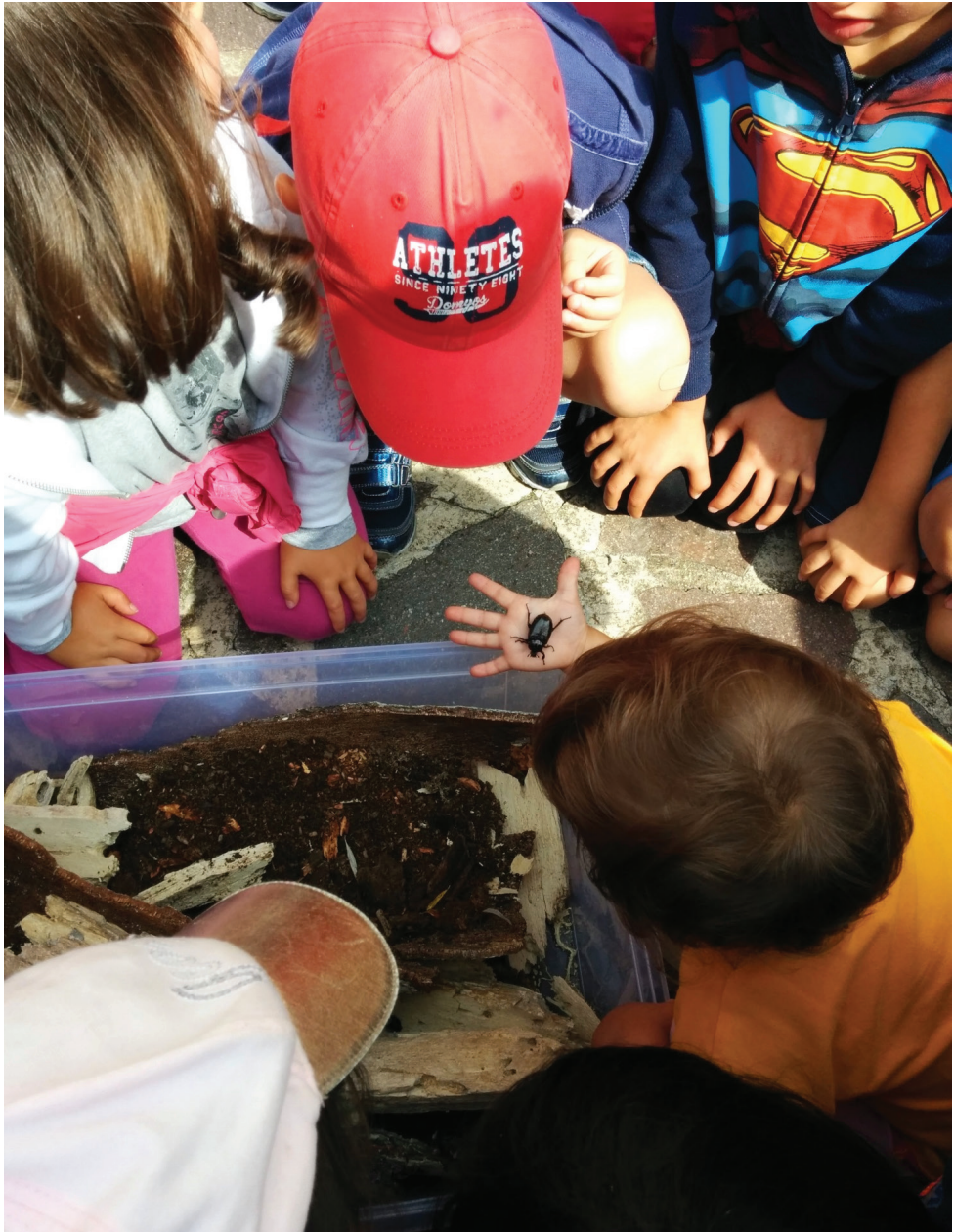
Figure 10. Dissemination activities with children: digging into dead wood and handling beetles.