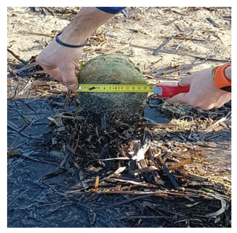
Figure 4. Biometric measurements of Pinna nobilis . Due to an exceptional low-tide day, some specimens were partially emerged.