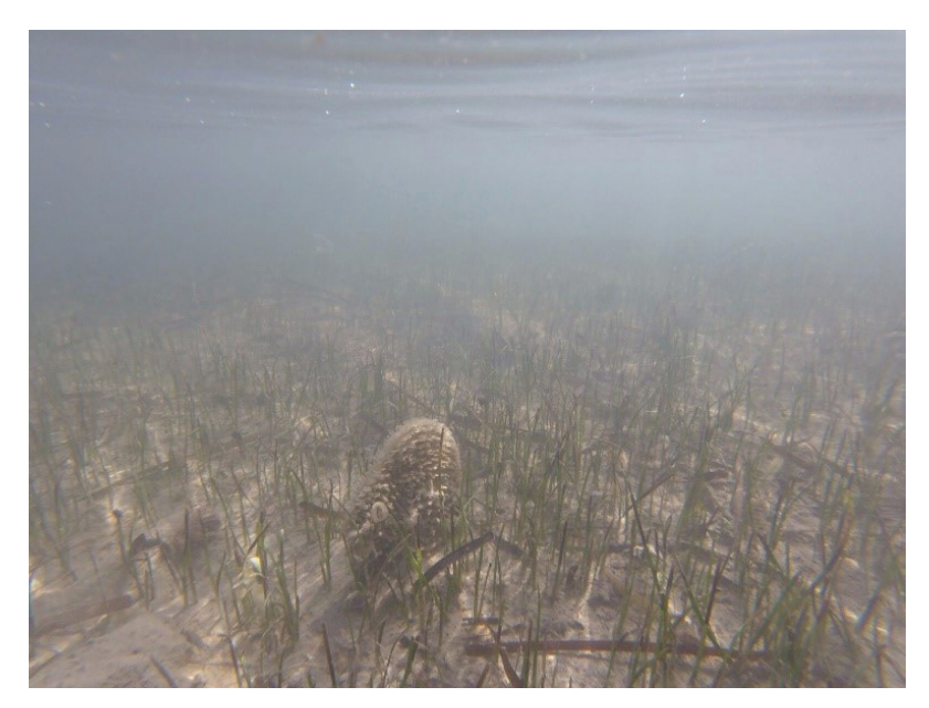
Figure 2. A specimen of Pinna nobilis in the Aquatina Lagoon (NATURA 2000 site " Aquatina di Frigole " IT9150003).