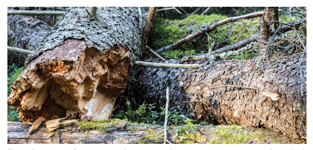
Figure 2. Brown rot of Fomitopsis pinicola , a common polypore on European spruce, Picea abies . Finland, Sipoo, Rörstrand, 2013.

Once started, decomposition gradually accelerates. Initially, when the wood is still very rigid, the heartwood is dominated by white-rot fungi; as fungi reproduce and develop, the number of brown-rot species increase heavily (Fig. 2) and the decomposition reaches its intermediate stage (Hiscox and Boddy 2017; Mäkinen et al. 2006) with fungi forming fruit bodies from early to late decay stages (Fig. 3). Finally, when wood is nearly completely broken down, the fungal fruiting bodies are no longer visible (Renvall 1995).