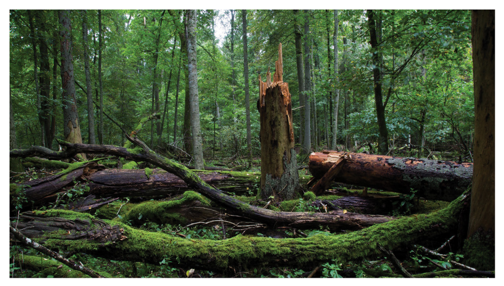
Figure 5. Wild and powerful beauty of undisturbed dead wood in a protected mixed forest. Lithuania, Punios šilas, 2017.