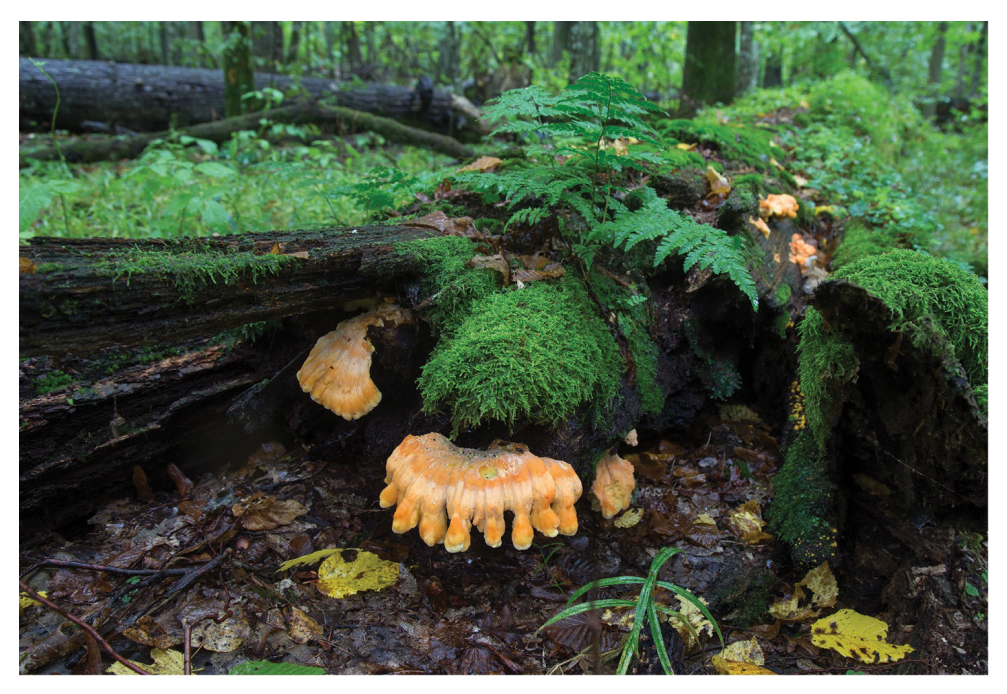
Figure 3. Fungal fruit bodies are formed as wood decomposes and fungal species compete for resources and succeed each other. Bright annual fruit bodies of Laetiporus sulphureus on oak logs. Lithuania, Punios šilas, 2017.

Fungal hyphae absorb nutrients from degraded wood, then grow and expand until they reach and intertwine or penetrate roots from surrounding trees and plants. Mutualistic relationships between fungi and plants allow plant roots to use much of the absorbed minerals (Baldrian 2017), greatly expanding the surface area and absorption capabilities of the root system. In return, trees and plants provide heterotrophic fungi with carbohydrates and sugar (Bobiec et al. 2005). This absorption system, while sophisticated, is not 100% efficient, leaving excess nutrients to pool in the soil and mineralise, encouraging seedling recruitment. Nearly all the nutrients held in densely shaded soil are provided and replenished by fungal hyphae. Fungal mycelium also lends structural support to soil which slows the rate of erosion (Zhang et al. 2016). Few people, outside of specialised researchers, realise the link between the dead wood, soil quality and soil stability; without the continuous presence of saproxylic fungi and dead wood, soil quality diminishes (Hartmann et al. 2012), producing low quality vegetation as land becomes unsuitable to sustain seed recruitment and development.