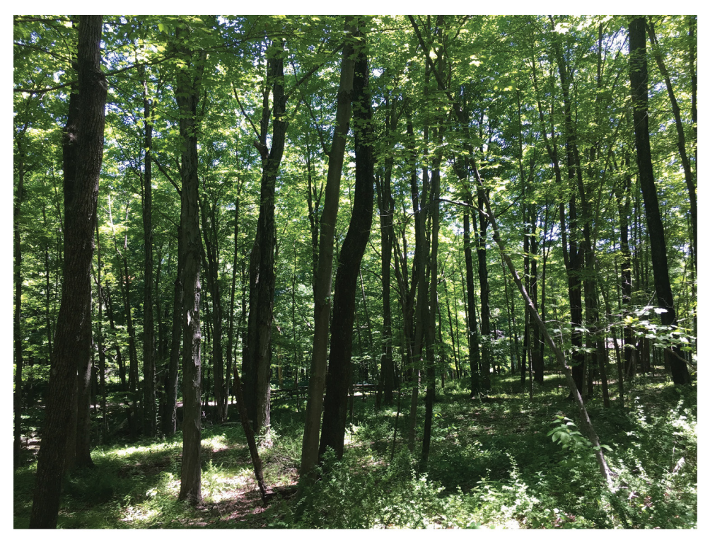
Figure 1. Managed park with almost no dead wood. New Jersey, USA, 2018.

debt facing saproxylic taxa worldwide (Chen and Hui 2009; Hanski 2000). For example, out of 45 well studied saproxylic beetle species existing during the Bronze Age, less than 1/3 have avoided extinction and were considered rare 30 years ago (Speight 1989). The reduction in dead wood habitat lowers saproxylic species richness and decreases genetic diversity within populations, leading to rippling consequences for forest ecosystems specially adapted to vast saproxylic communities and leaving them vulnerable to disturbances and extinction (Sebek et al. 2013).