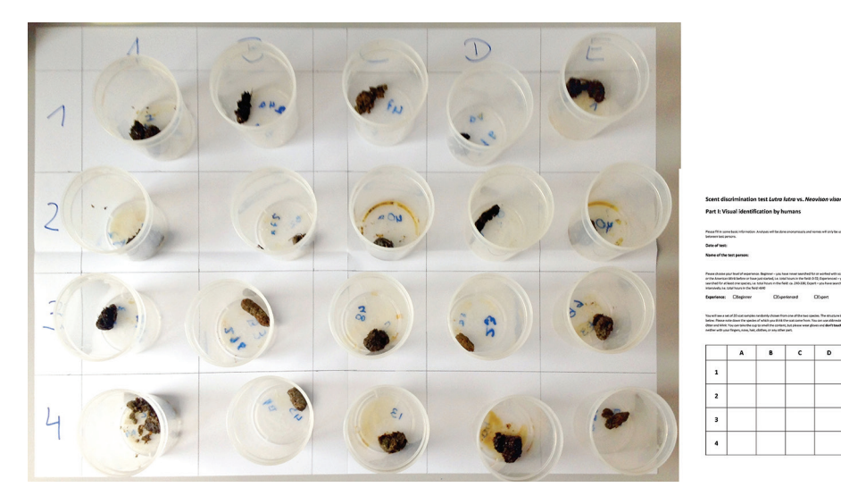
Figure 3. Setup for human scent discrimination test.

To ensure a standardised testing procedure between dog and human abilities, we used the scent box for final discrimination tests with dogs (Fig. 1). We created test protocols with 20 random trials. Each trial contained one cup with an individual otter scat and one cup with an individual mink scat as well as three blanks (Suppl. material 1: S1.2). We ensured that each of the 20 test samples was used at least once. The target and non-target species were correctly assigned if the dog alerted to or ignored that cup, respectively. All tests were conducted double-blind (Suppl. material 1: S1.2).