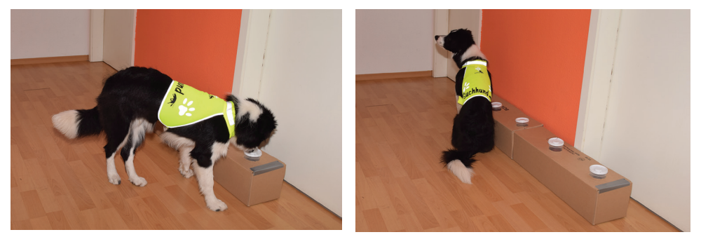
Figure 1. Searching along the scent box (left) and alerting at the target scat (right), taking the example of the otter scat detection dog Zammy.

ing, snowing) and wind conditions (none to severe). To enlarge the dogs' scent range, we used genetically verified scat samples of male and female otters from the Upper Lusatia additionally to the samples from captivity. After both dogs were able to detect all otter and ignore all mink scats in ten subsequent blind trials, whereby each trial contained 1–2 otter and 1–2 mink scats, we also took the dogs to areas where Eurasian otters but no American minks were present to mimic field conditions and verify whether the dogs would alert on wild scats. We obtained permission from pond farmers and local game authorities for all pond areas where we conducted field training.