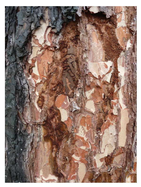
Figure 4. Larval galleries of Stephanopachys linearis in the Scots pine bark.