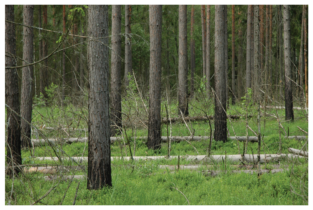
Figure 2. Scots pines burned by fire - host trees of Stephanopachys linearis (photo by J.M. Gutowski, 2017).