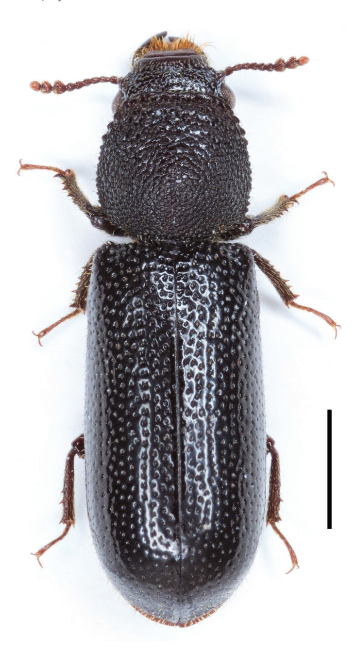
Figure 1. Stephanopachys linearis ; the specimen collected in Białowieża Primaeval Forest in 2015 – dorsal view. Scale bar = 1 mm.

Also in 2017, black, baited funnel traps were suspended near the place where S. linearis had been previously collected and, in one of them one more specimen (22.05.–5.06.2017) and remnants of another one (20.06.–3.07.2017) were found.