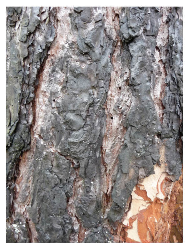
Figure 3. Imago outlets of Stephanopachys linearis (photo by J. Borowski, 2017).